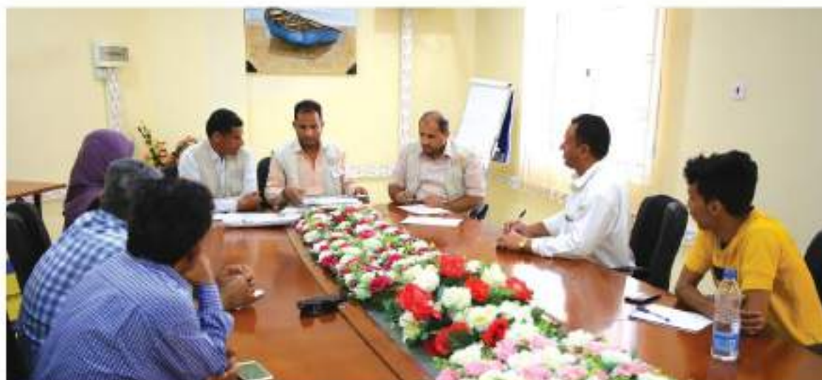
Opening the expenses of the project for the distribution of shelter non-food items - Al-Tahita District - Al-Hodeidah Governorate