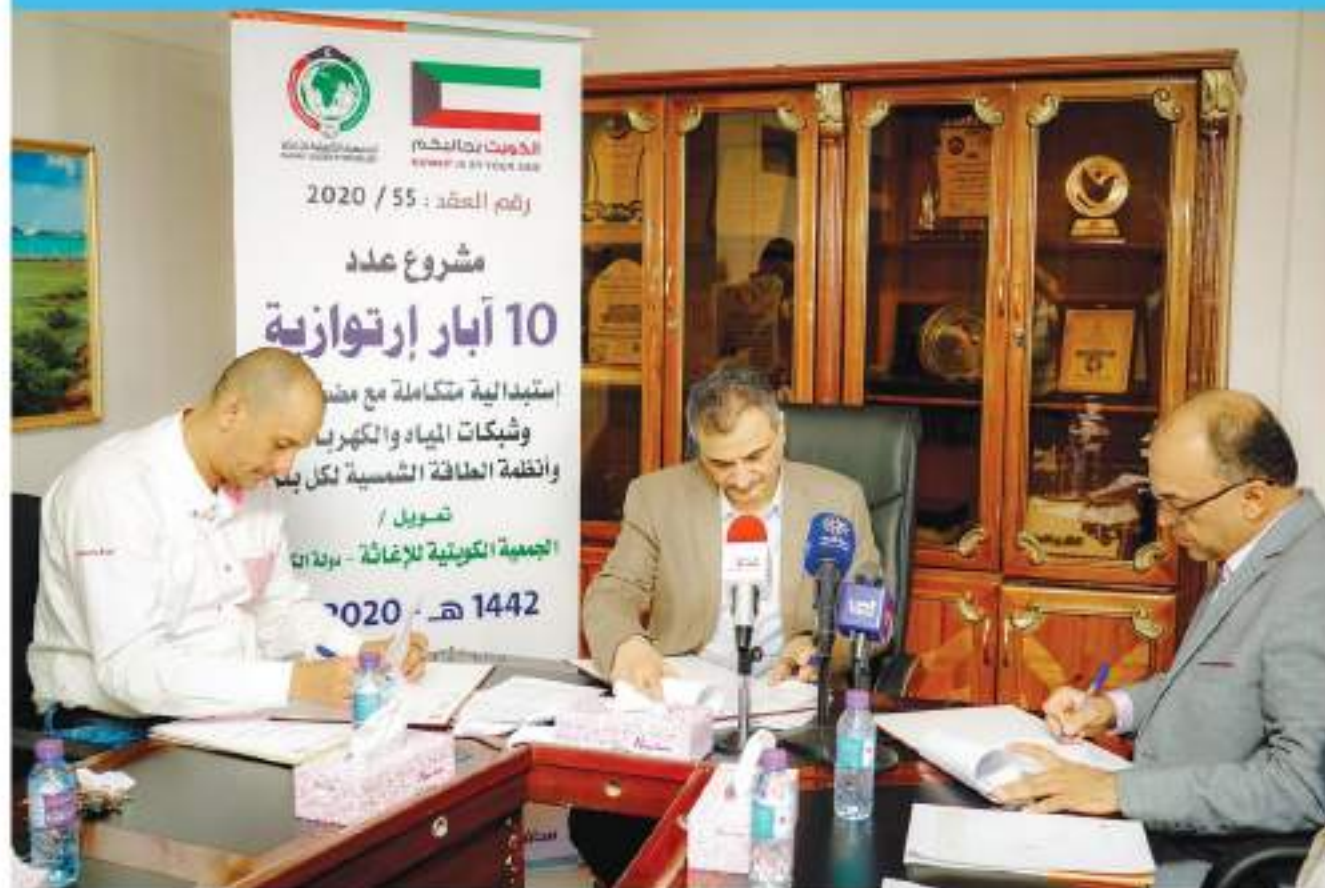
* During the Memorandum of Understanding was signed by the Governor of Aden.