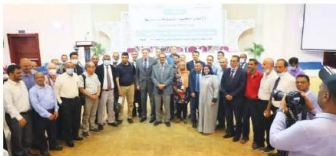
Twasul participation in the event of Ministry of Health activities