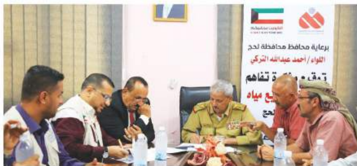
A memorandum of intention to carry out water projects was signed with the governor of the Lahj Governorate