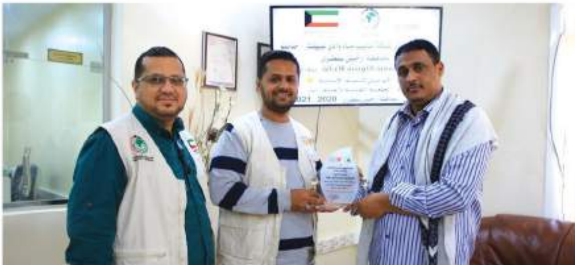
Accreditation by the Socotra Ministry of Water Office.