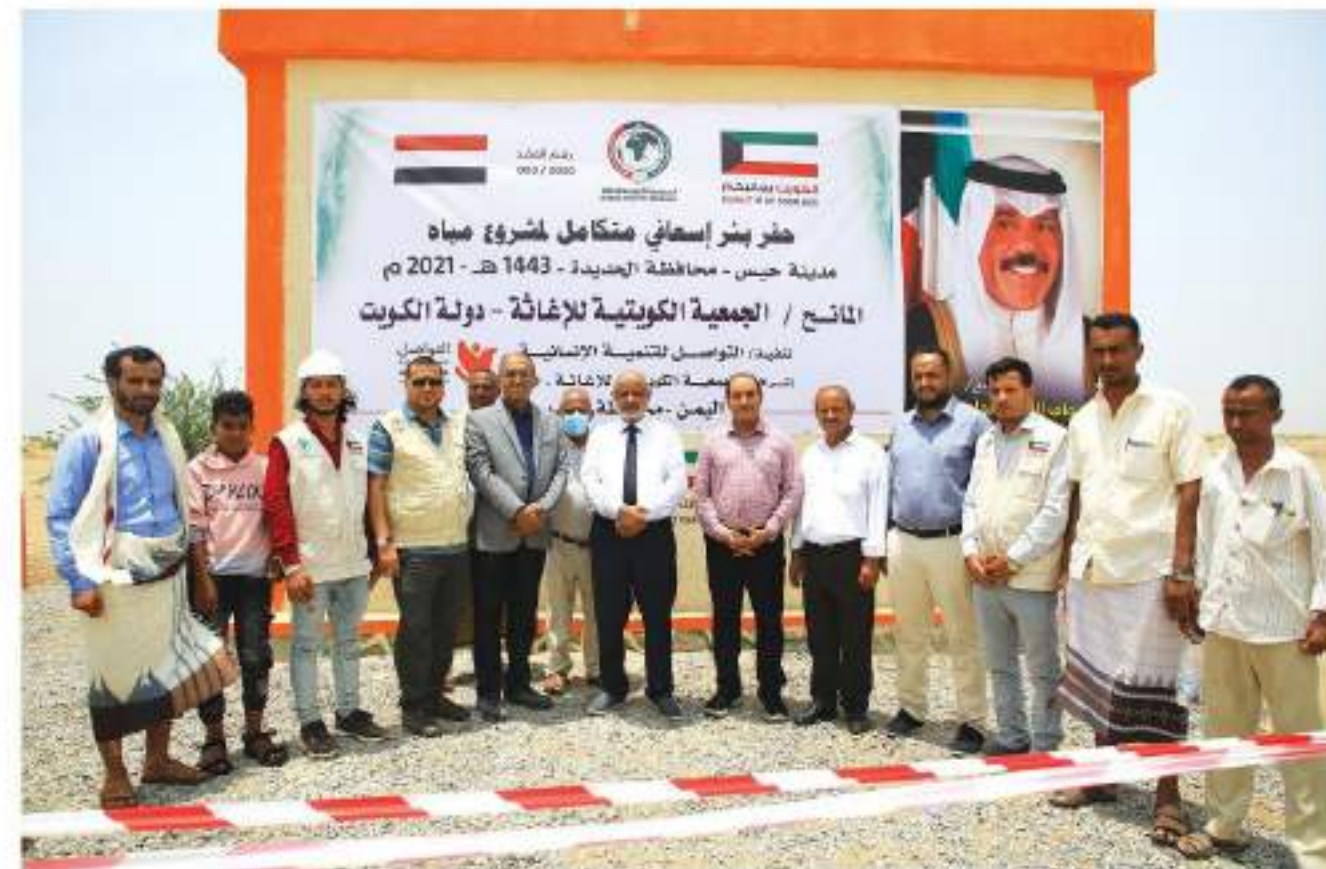
During the inauguration of an integrated emergency well for the city of Hays by the governor of Hodeidah Governorate