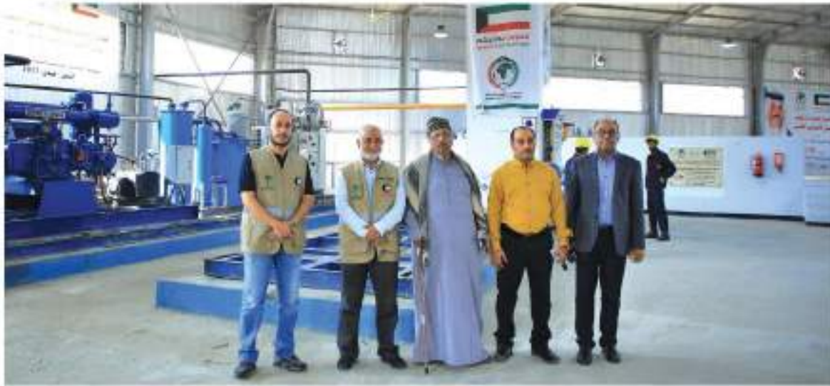
A Team from the Kuwait Relief Society's visit to the Medical Oxygen Factory-Aden project