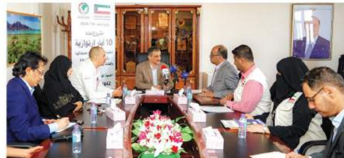
Initiating the Nasser Well Water Project included signing a memorandum of agreement with Mr. Ahmed Lamias, Governor of the Aden Governorate.