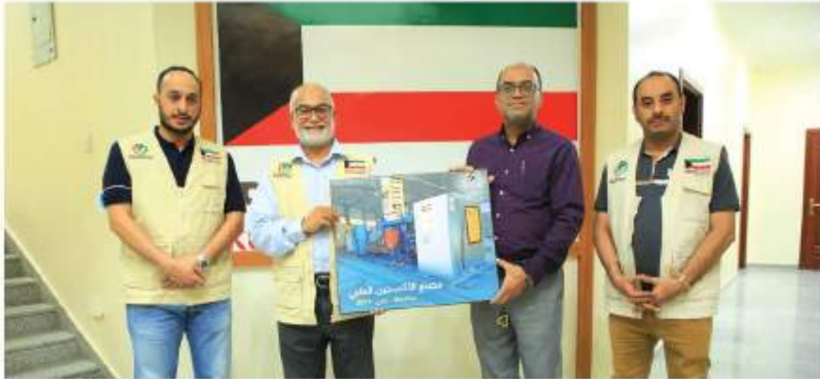
A Team from Kuwait Relief Society's visit to the organization.