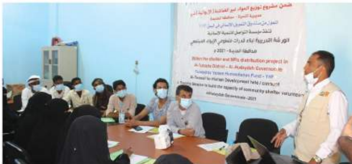
Training workshop to build the capacities of community shelter volunteers