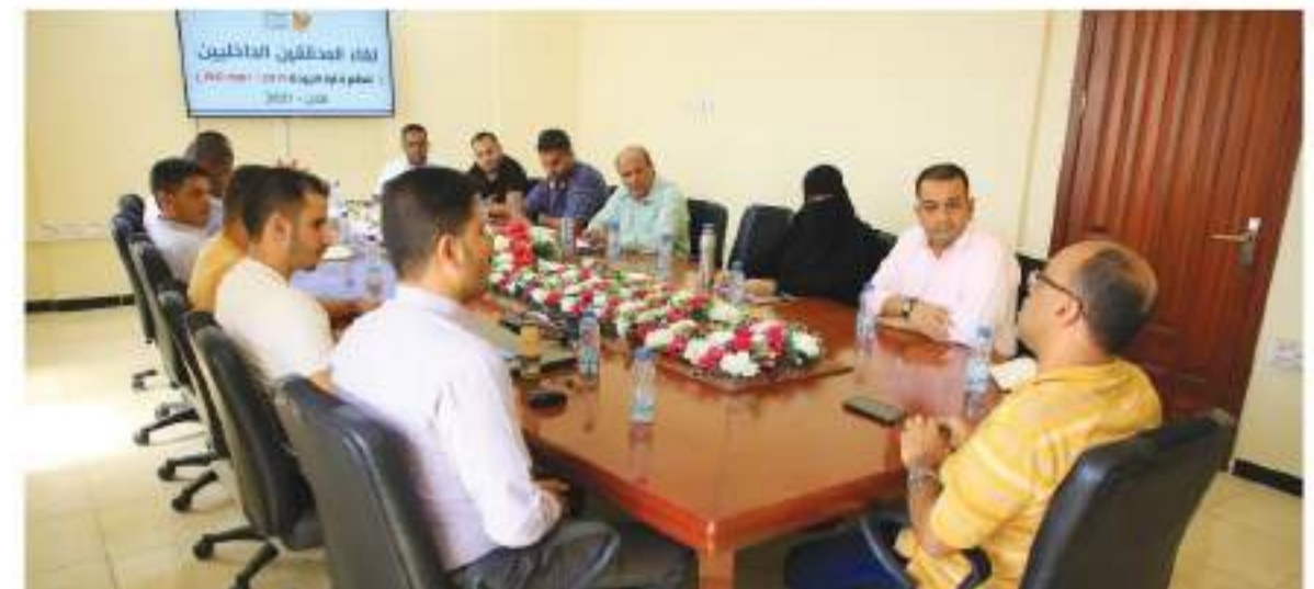
During one of the quality management system internal audit sessions