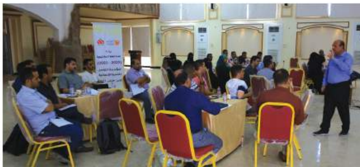
During the training workshop for preparing the strategic plan - Aden - November 2021