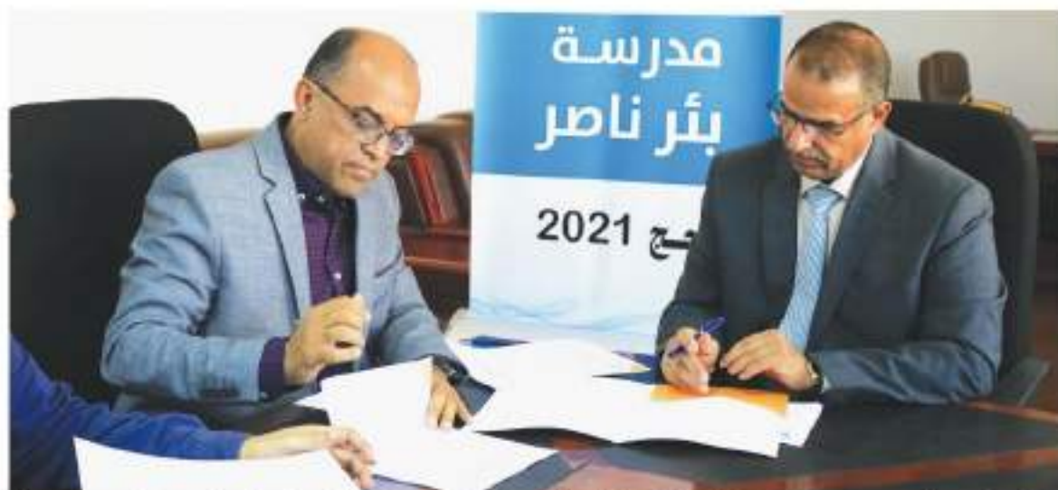
A memorandum of understanding to construct a school in the Lahj Governorate was signed under the sponsorship and direction of Dr. Mohamed Al-Zouari, Minister of Social Affairs and Labor.