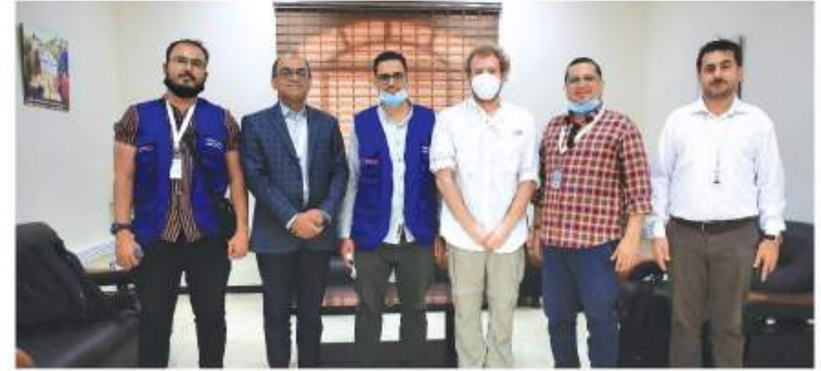
International Organization for Migration's cooperation and coordination (IOM).