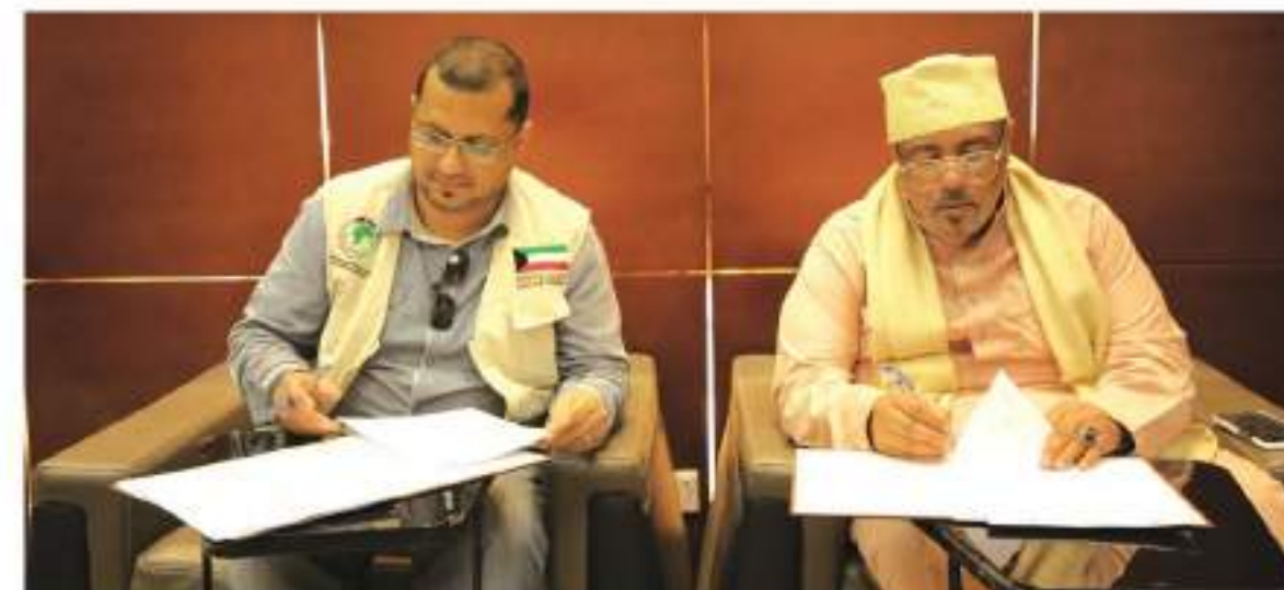
Signing a contract with the High Relief Committee to carry out an initiative to provide aid