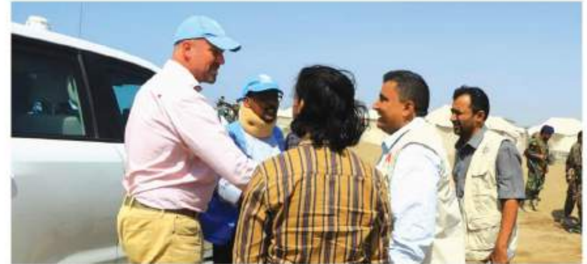
During his visit to one of the foundation's projects in the city of Al-Khokha - Al-Hodeidah, the director of the OCHA office, Aden branch